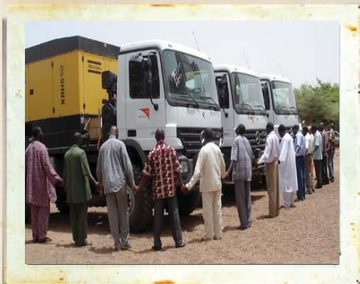
World Vision staff members gather to seek God's blessing on new equipment before beginning drilling activities in Bla, Mali.